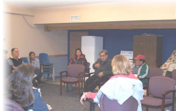
Senator Albert Kookesh and Representative Woodie Salmon visit McGrath

With only a few hours notice due to weather-causing a change of schedule, invitations were shared by email, KSKO and the online message board, to visit with Senator Kookesh and Representative Salmon. Interested residents gathered during an impromptu Breakfast Club meeting. Twelve representatives from the City, McGrath Native Village Council, Iditarod Area School District, Southcentral Foundation, UAF-McGrath Center and several residents joined Kookesh and Salmon on Sept. 26 th at the Cap'n Snow Center Assembly Room. The group was able to hear what is on the horizon in Juneau. McGrath folks were able to share needs, challenges and concerns in support of McGrath's future with the visitors. As usual, an abundance of food was served and the travelers were sent off with plenty of snack foods for the next leg of their journey through the Kuskokwim and Yukon village as they traveled in Salmon's private plane.